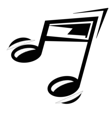
St Johns Choir